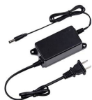
DC12V/2A Power Adapter